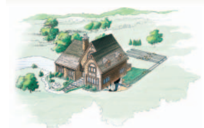
Horizontal Loops: Used on larger lots. Installed using a backhoe or trencher.

Geothermal systems can be installed with a variety of loop system configurations. "Closed loops" use re-circulated fluid in a series of pipes installed vertically, horizontally, or in a pond. "Open loops" use well water. Your dealer will determine which design works best for your home.