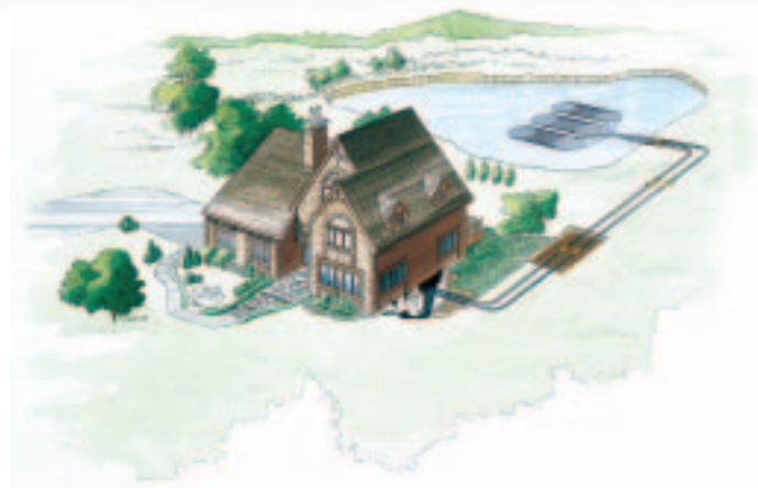
Pond Loops: Coils of pipe are fabricated and sunk to the bottom of the pond.