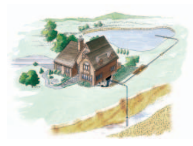
Open Loop: Well water from an existing well can be used, then discharged into a drainage ditch or pond.