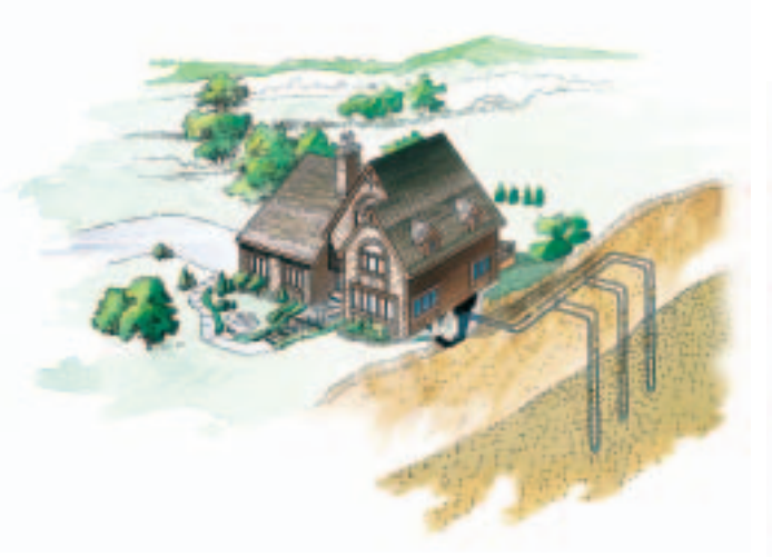
Vertical Loops: Used where land area is limited or soil conditions prohibit horizontal loops. Installed using a drilling rig.