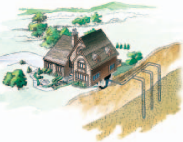
Vertical Loops: Used where land area is limited or soil conditions prohibit horizontal loops. Installed using a drilling rig.