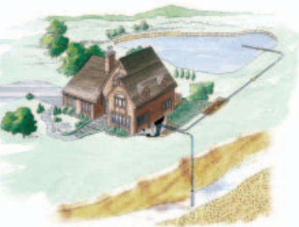
Open Loop: Well water from an existing well can be used, then discharged into a drainage ditch or pond.