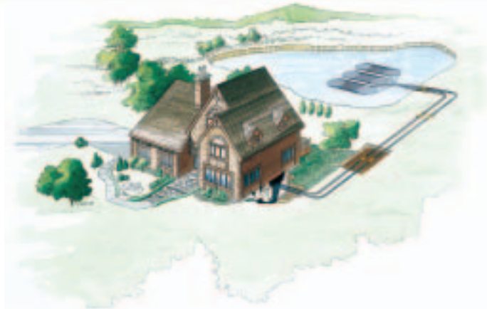
Pond Loops: Coils of pipe are fabricated and sunk to the bottom of the pond.