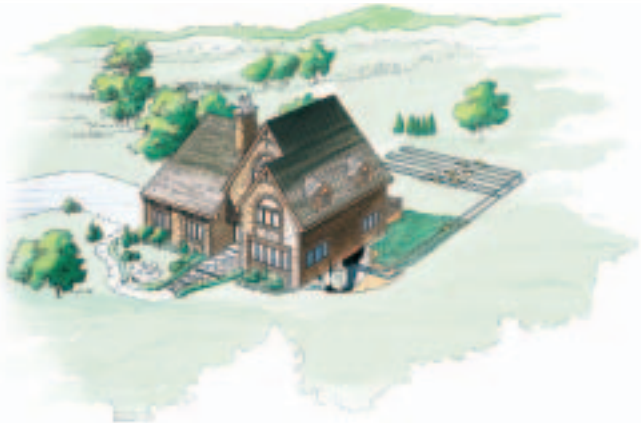
Horizontal Loops: Used on larger lots. Installed using a backhoe or trencher.

Geothermal systems can be installed with a variety of loop system configurations. "Closed loops" use re-circulated fluid in a series of pipes installed vertically, horizontally, or in a pond. "Open loops" use well water. Your dealer will determine which design works best for your home.